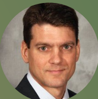
COMMISSIONER SCOTT WHITE